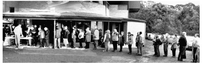
The Sunday Barbe-Que

On the Sunday there were more interesting talks, viewing of the AVs, a BBQ lunch and more time for photography before most headed home, although there were more activities planned for Monday