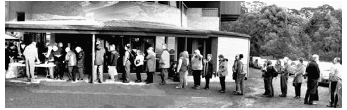
The Sunday Barbe-Que

On the Sunday there were more interesting talks, viewing of the AVs, a BBQ lunch and more time for photography before most headed home, although there were more activities planned for Monday